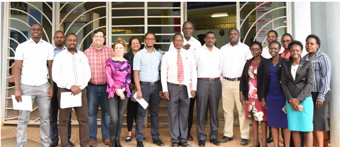
Figure 4. Biobank training at Ampath Oncology Institute, Eldoret, Kenya, January 2019.

tium (BBMRI-ERIC) as an observer. IARC collaborates with BBMRI-ERIC members for international networking and interoperability issues to ensure that the structures and common services (CS) developed within Europe will be accessible to wider international communities. LSB also participates in working groups – for CS information technology (IT), CS ethical, legal, and social issues (ELSI), European Paediatric