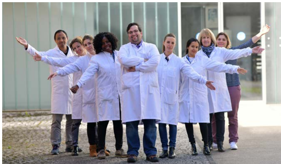
Figure 1. Laboratory Services and Biobank Group team photo.

state-of-the-art scientific instruments and the provision of sample storage capacity.