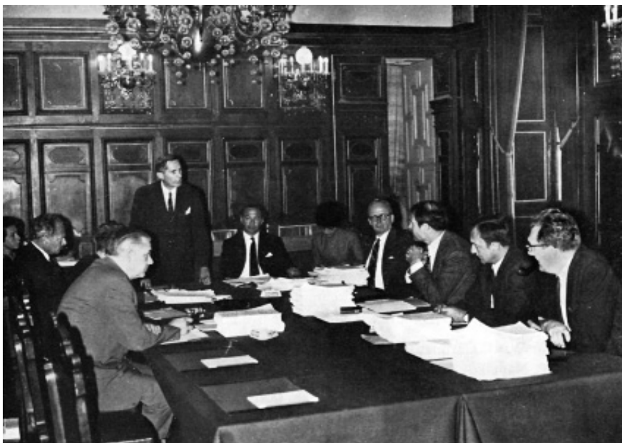
Director, IARC, opening a session of the Fellowships Selection Committee in a room put at the disposal of the Agency by the Mayor of Lyon.

SINCE 1966, IARC HAS AWARDED 570 FELLOWSHIPS TO TALENTED YOUNG SCIENTISTS FROM 73 COUNTRIES. OF THE FELLOWSHIPS AWARDED, 23% HAVE BEEN IN THE AREAS OF EPIDEMIOLOGY OR BIostatISTICS WITH THE REMAINING 77% SPLIT AMONG VARIOUS LABORATORY-ORIENTED DISCIPLINES. IN THE FIRST 30 YEARS OF THE PROGRAMME THE FELLOWS WERE PREDOMINANTLY MALE (~80%), HOWEVER IN THE PAST 10 YEARS THE NUMBER OF WOMEN RECEIVING IARC FELLOWSHIPS HAS INCREASED TO 54%. APPROXIMATELY 85% OF FELLOWS RETURN TO THEIR HOME COUNTRY ON COMPLETION OF THEIR TRAINING, AND AROUND 82% REMAIN ACTIVE IN CANCER RESEARCH .