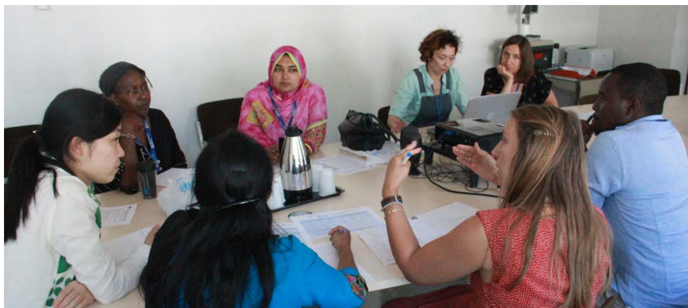
Figure 2. IARC Summer School 2017, module on Implementing Cancer Prevention and Early Detection.

The IARC “50 for 50” initiative, organized in conjunction with the scientific conference held in Lyon on 7–10 June 2016 to celebrate the 50th anniversary of the establishment of IARC, was a fellowship programme that brought together, in Lyon, 50 future leaders in cancer research from LMICs, one for each year of IARC’s existence. The selected participants came from 36 countries across the globe. The one-week programme included participation in the three-day scientific conference, a two-day pre-conference workshop, and a series of networking events to foster collaborations. A dedicated online space was set up for preparatory work, providing access to a variety of resources and networking. The vast majority of the participants rated the initiative very positively, stressing the quality of the interactions and the opportunity to learn about a wide variety of research topics and meet world experts in those fields.