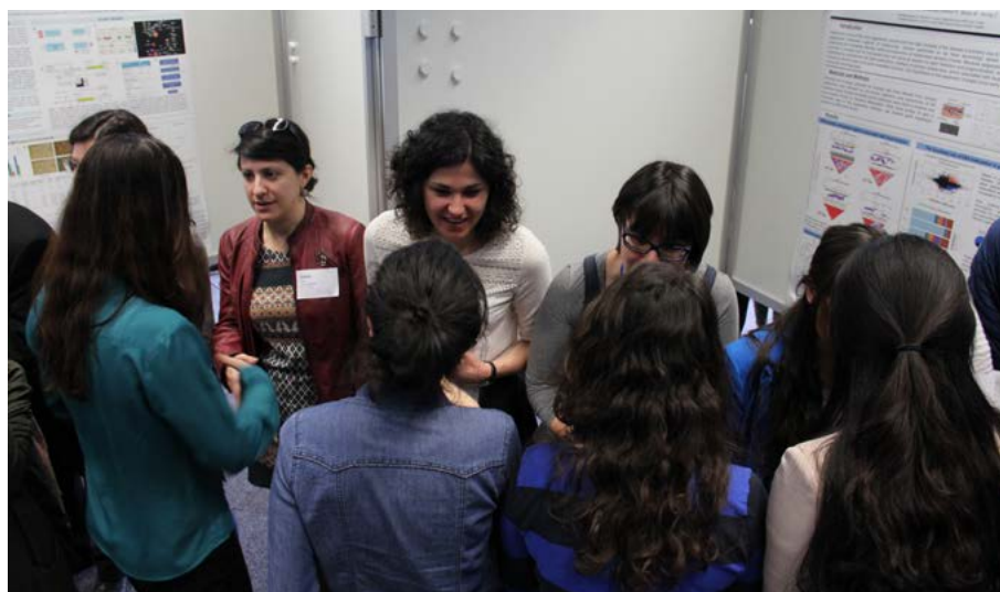
Figure 1. ECSA Scientific and Career Day 2016.

In view of budget constraints, the IARC Summer School in Cancer Epidemiology was not held in 2016. The event was held in Lyon in June–July 2017, with the goal of improving the methodological and practical skills of cancer researchers and health professionals. A new one-week module on Implementing Cancer Prevention and Early Detection (Figure 2) was organized and ran in parallel with the module on Cancer Survival Methods for Cancer Registries, followed by the two-week module on Introduction to Cancer Epidemiology. Additional financial support for the