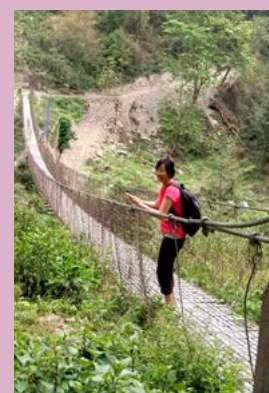
A Bhutanese nurse on her way to a rural health centre to perform cervical cancer screening.

Finally, ICE helped create computerized medical databases and biobanks of urine samples, cervical cells, and cancer tissue samples and facilitated exchanges between local and international experts at IARC and at international scientific meetings. A few master's students and doctoral students from Bhutan and Rwanda are being supervised by ICE staff, and many more have had the chance to spend short periods at IARC or attend the IARC Summer School.