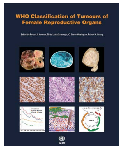
Figure 2. Cover of WHO Classification of Tumours of Female Reproductive Organs , fourth edition.

In 2014–2015, the sixth volume (Tumours of Female Reproductive Organs) and seventh volume (Tumours of the Lung, Pleura, Thymus and Heart) have been published, and preparation of the eighth volume (Tumours of the Urinary System and Male Genital Organs), the ninth volume (Head and Neck Tumours), and the tenth volume (Tumours of Endocrine Organs) is under way. In addition, updates to the first and second volumes of the fourth edition, Tumours of the Central Nervous System and Tumours of Haematopoietic and Lymphoid Tissues, are in progress.