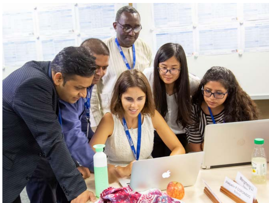
Figure 2. IARC Summer School 2019 module on Implementing Cancer Prevention and Early Detection.

Specialized and advanced courses are organized by IARC’s scientific Groups, sometimes with the support of ETR. Most of these courses are associated with collaborative research projects, in which IARC is transferring skills needed to conduct the projects and to enable the subsequent implementation of the research findings in the countries concerned. Specialized courses are often co-organized with external partners and are held at diverse locations worldwide (Table 3). During the biennium, more than 50 courses were organized, enabling the training of about 1700 scientists and health professionals.