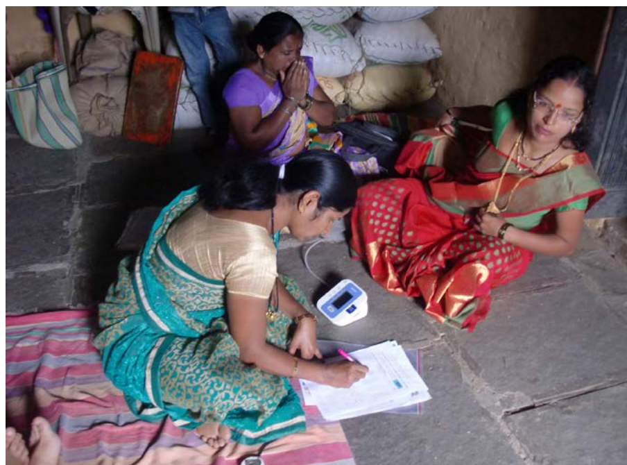
Figure 6. Cancer screening mobilization in a rural area in India.

(28.0%), E6-positive women had a much higher 10-year cumulative incidence rate (53.0%) of CIN of grade 3 or higher (CIN3+) compared with those who tested positive with cytology or VIA.