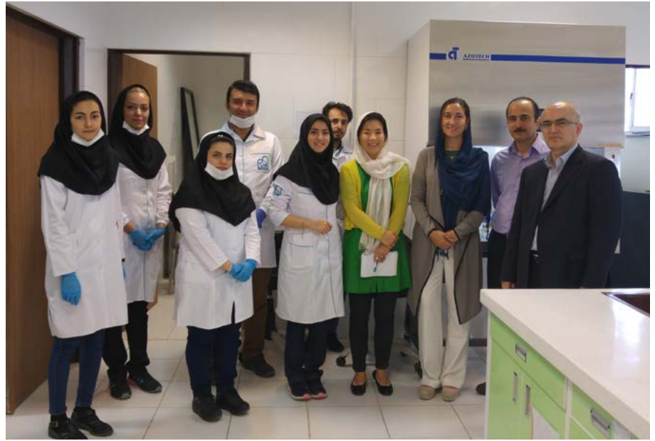
Figure 3. The HELPER study team at the National Cancer Center, Republic of Korea, in July 2017.