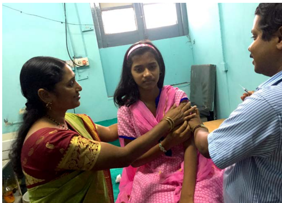
Figure 5. HPV vaccination in girls 10–18 years old in India.

The effectiveness of fewer than three doses of quadrivalent HPV vaccine in preventing cervical neoplasia is being evaluated among 17 729 participants in India (Figure 5). Two doses were reported to be as immunogenic as three doses against HPV 16 and 18; even recipients of a single dose demonstrated robust and sustained immune responses, albeit inferior to those of