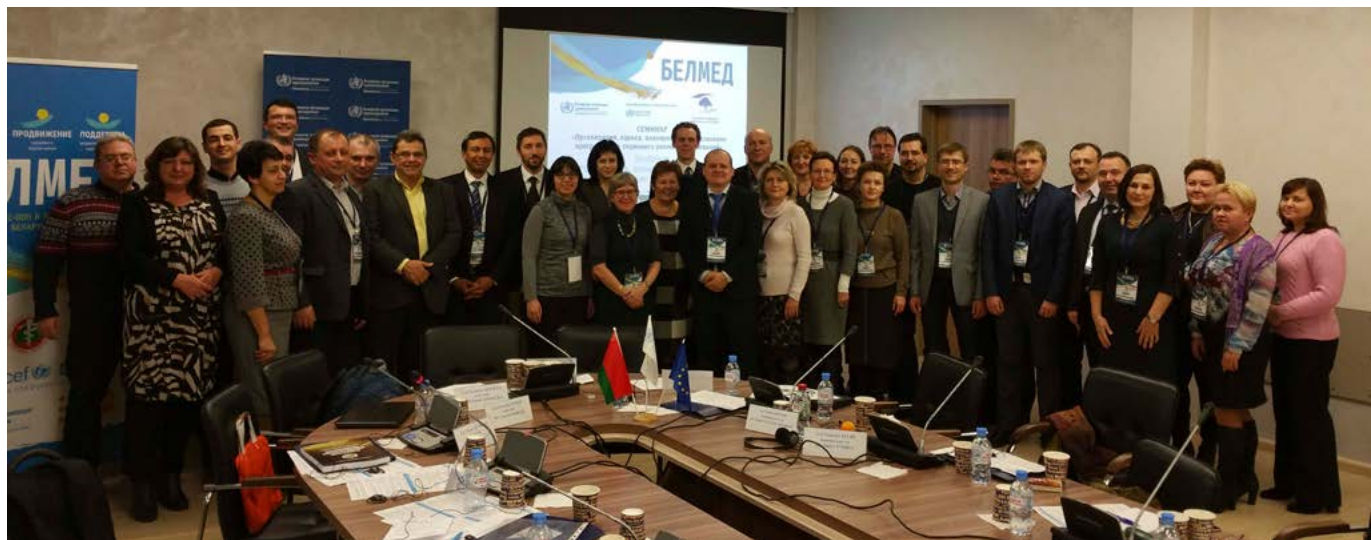
Figure 4. Training course on breast cancer epidemiology and screening in Belarus, in December 2016.

increasing vaccination coverage. With the collaboration of academic groups in France, PRI has developed and piloted at Saint-Étienne an HPV educational intervention based on behaviour change theories, and will test this intervention through a randomized clinical trial in Lyon.