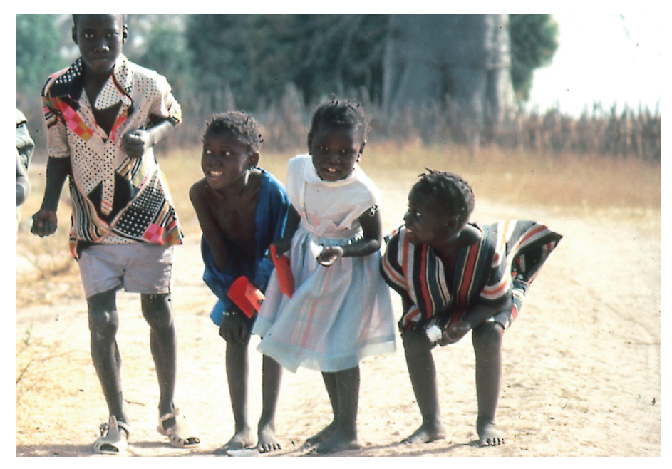
Childhood vaccination in The Gambia

INITIATED IN 1986, THE GAMBIA HEPATITIS INTERVENTION STUDY (GHIS) IS A JOINT ENDEAVOUR OF IARC, THE MEDICAL RESEARCH COUNCIL OF THE UK AND THE GOVERNMENT OF THE REPUBLIC OF THE GAMBIA, AIMED AT ASSESSING THE PROTECTIVE EFFICACY OF INFANT HEPATITIS B VIRUS (HBV) VACCINATION OF INFANTS AGAINST CHRONIC LIVER DISEASE AND LIVER CANCER IN ADULTS. THE GAMBIA, IN WEST AFRICA, IS A COUNTRY OF HIGH ENDEMICITY FOR CHRONIC HBV CARRIAGE. CONTAMINATION OF THE DIET BY AFLATOXIN, A CARCINOGENIC MYCOTOXIN, IS WIDESPREAD. THESE TWO FACTORS HAVE A SYNERGISTIC EFFECT ON THE RISK OF HEPATOCELLULAR CARCINOMA (HCC).